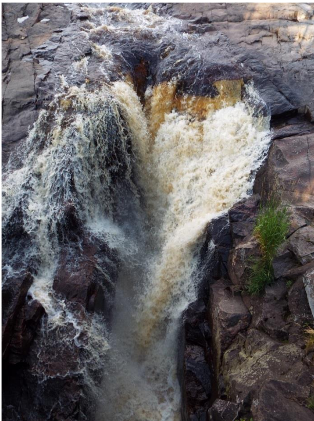
St. Regis River entering the flume in Parishville

The route starts at the junction of Main Street and Pierrepont Avenue (NY 56) in Potsdam. Parking is available in the municipal lot just behind the fire station on the northwest corner. From this parking lot, cross Pierrepont and head east on Main Street. As you approach the edge of the village, Main Street curves right and becomes Outer Main, as it passes by the east side of the SUNY Potsdam campus. At the village edge, Outer Main becomes the Old Potsdam-Parishville Road. This road bears left at a Y-junction at 1.9 miles, and gradually climbs toward Parishville. You will pass the upper end of Allen Falls Flow, and then come to a stop sign where the road ends at NY 72. Turn left on NY 72, and you will steeply climb up to the hamlet of Parishville. On entering Parishville, you will find a convenience store on your left. Soon after is the bridge over the west branch of the St. Regis. The river is dammed just below the highway. If you take a left just after the bridge, you will find a pedestrian bridge below the dam that overlooks a dramatic gorge that the river passes through.